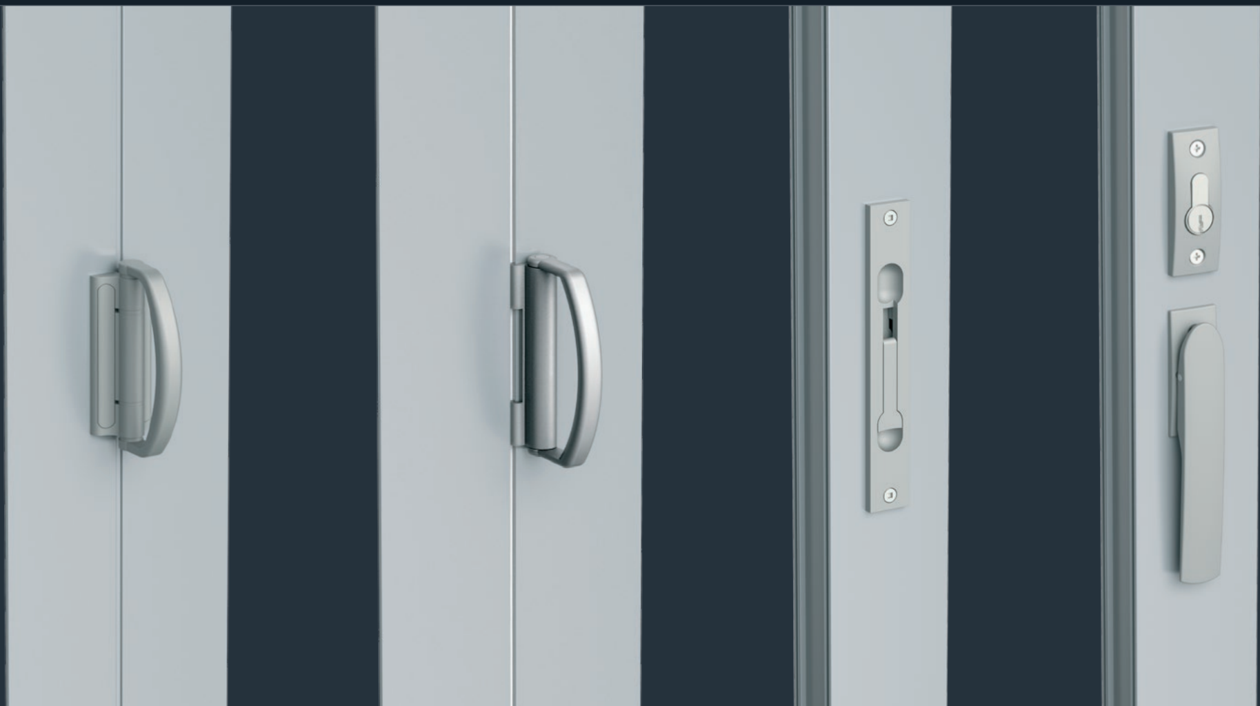
Twin bolt lever